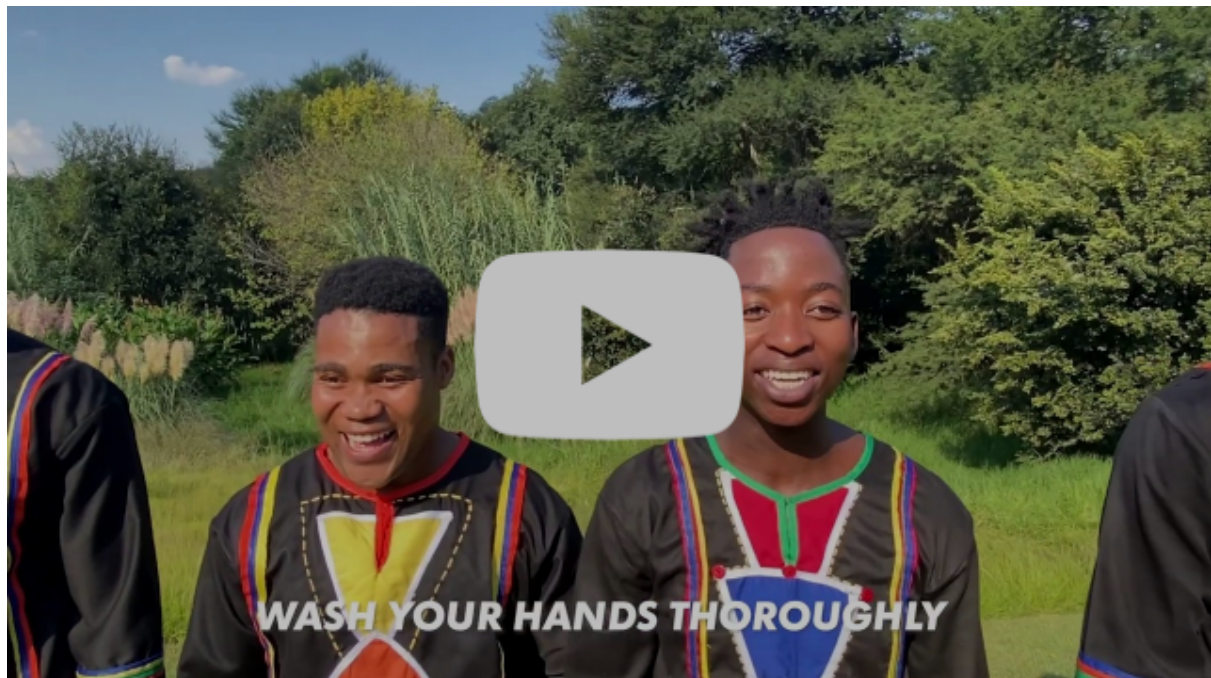
Ndlovu Youth Choir | Keeping us informed & our spirits high!